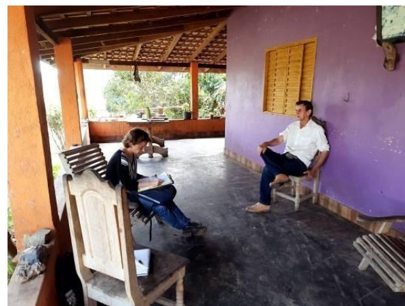
Figure 1: Questionnaire application with residents of the Perseverança Pacutinga Settlement on June 06, 2022, part of the socio-environmental diagnosis. Colniza/MT.

This is the progress report produced by Systemica, the current developer of the project.